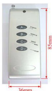
remote control size